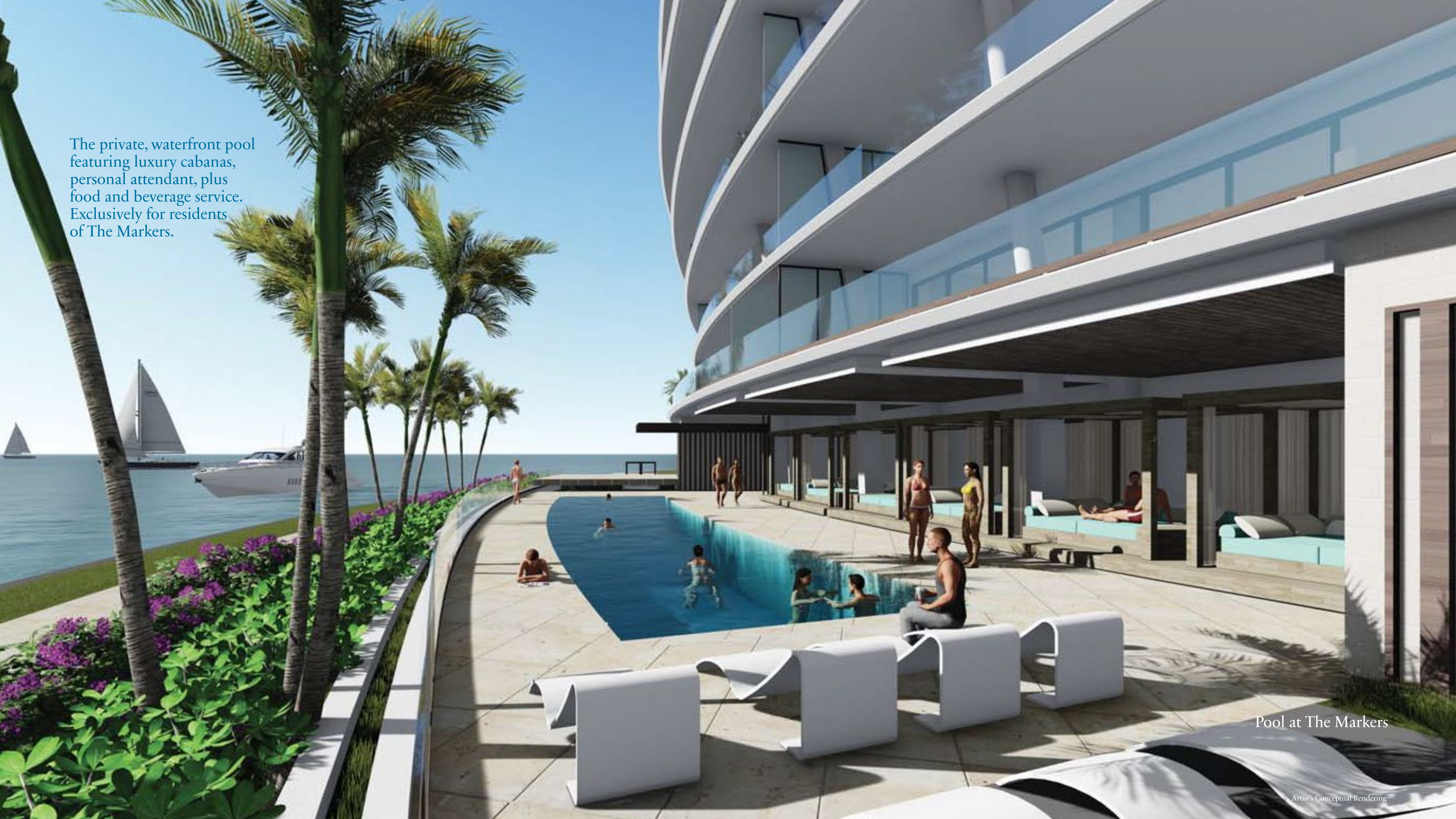
Pool at The Markers

The private, waterfront pool featuring luxury cabanas, personal attendant, plus food and beverage service. Exclusively for residents of The Markers.