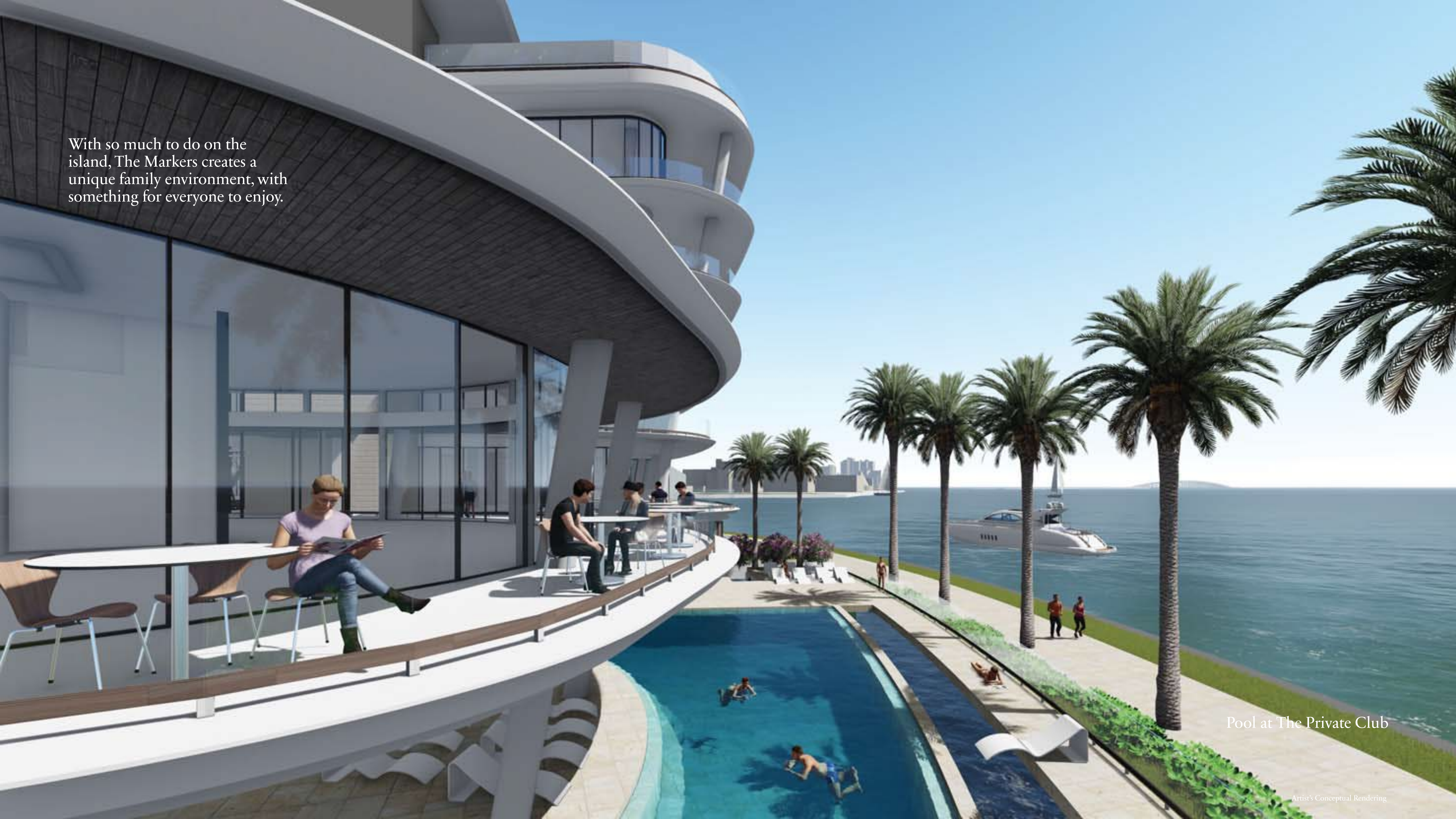
Pool at The Private Club

With so much to do on the island, The Markers creates a unique family environment, with something for everyone to enjoy.